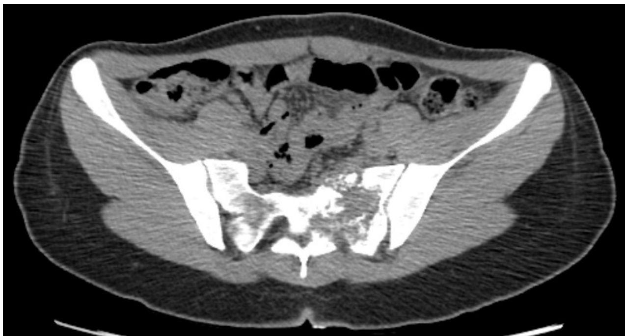
Figure 1: Case 1. Sacral capillary hemangioma. Preoperative CT scan. Note the presence of an isodense mass in the left hemi-sacrum with osteodestructive with extension to the ipsilateral sacroiliac joint without interruption of the bone cortex at the level.

student with negative past medical history, who arrived at the emergency department of our Institute complaining intense sacral pain, resistant to analgesics and progressively worsened in the last month. The CT scan of the lumbosacral spine showed a 53 × 45 × 39 mm isodense mass in the left hemi-sacrum with osteodestructive phenomena causing interruption of the cortical bone in the antero-inferior portion of the sacrum itself, and with extension to the ipsilateral sacroiliac joint without interruption of the bone cortex at that level (Figure 1). The MRI confirmed the presence of the mass which also showed signs of extraosseous extension within the left pre-sacral space of the pelvic cavity and inside the left S1-S2 neuroforamina. The lesion was isointense (relative to pelvic visceral contents) on T1WI, and hyperintense on T2WI; it also showed marked enhancement after gadolinium injection (Figure 2). The tumor, thought to be an aggressive sacral sarcoma, was partially embolized and then biopsied. Upon histopathological examination, it appeared as a collection of lobules containing clusters of thin-walled capillaries separated by thin reticular septa. Final diagnosis was that of "capillary hemangioma". The patient was then offered two treatment options, i.e., complete Onyx® embolization and radiotherapy. In relation to the potential risk of infertility due to the proximity of the ovaries, radiotherapy was, though, excluded.