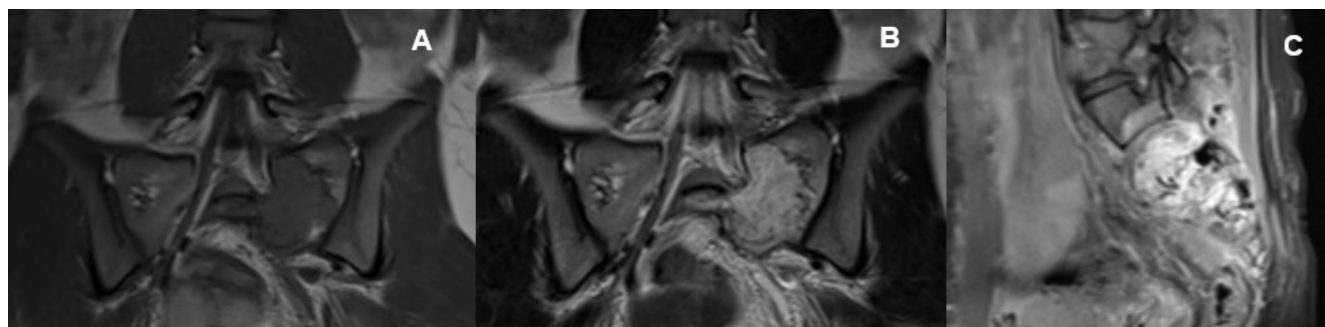
Figure 2: Case 1. Sacral capillary hemangioma. Preoperative MRI. (A) Coronal section, T1WI showing a non-enhanced isointense mass within the left sacrum. (B) Coronal section, T2WI showing hyperintensity of the lesion. (C) Sagittal section, T1WI C+. Note the avid enhancement of the lesion.

According to some authors, it is possible for CHs to progress to cavernous hemangiomas [8,19] which, unlike childhood CHs, do not present any type of involution [19].