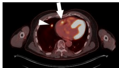
Figure 5: A follow-up axial PET/CT image after 6 months of immunotherapy shows significantly reduced PET avidity at right atrium (arrow). The right middle lobe mass has grown and was treated with XRT (an interim scan is not shown) and now demonstrates strong avidity but is stable over a 3 month period since radiation treatment (arrowhead).