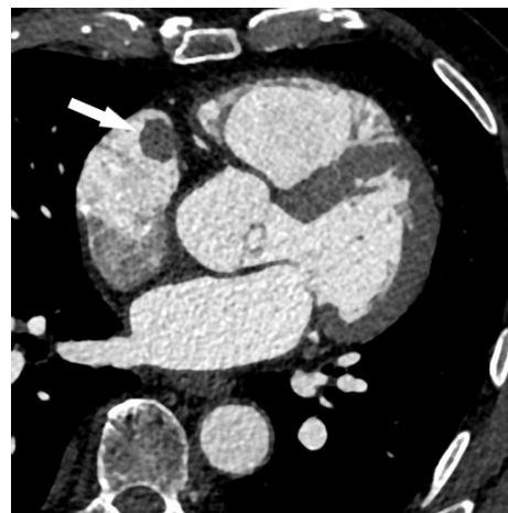
Figure 4: Axial imaging from CT TAVR shows the right atrial metastasis (arrow).