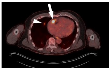
Figure 2: An axial PET/CT image reveals an arrow of strong avidity at right atrium of the heart (arrow) and a faint right middle lobe nodule (arrowhead). These findings developed off active therapy and amidst surveillance follow-up.