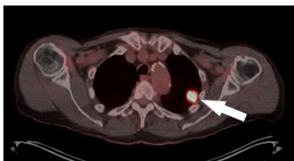
Figure 1: An axial PET/CT image demonstrates a new 2.2 cm left upper lobe mass with avidity as noted by arrow. This occurred after attaining a partial response to immunotherapy and stability of remaining disease at 1 ½-year treatment duration.

improvement and became more cognitively interactive and able to converse via telephone interview 10 months after the cardiac metastasis was diagnosed.