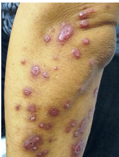
Figure 1: Skin papules located on the arm in a patient with PDH associated with AIDS.