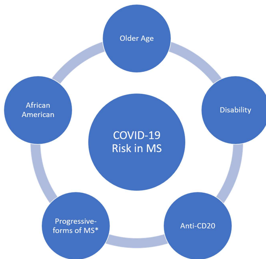
Figure 2: Risk-factors Associated with COVID-19 Risk in MS. Figure shows risk-factors associated with worse COVID-19 outcomes in MS patients. *= Progressive forms of MS have yet to be found to be statistically significant.

for MS patients during the COVID-19 pandemic is still warranted with respect to those who are older, have more comorbidities and have significant disability, but we should bring into question MS and DMTs as severe COVID-19 risk factors (Figure 2). In this review, we aim to summarize clinical and basic science data surrounding COVID-19 and MS.