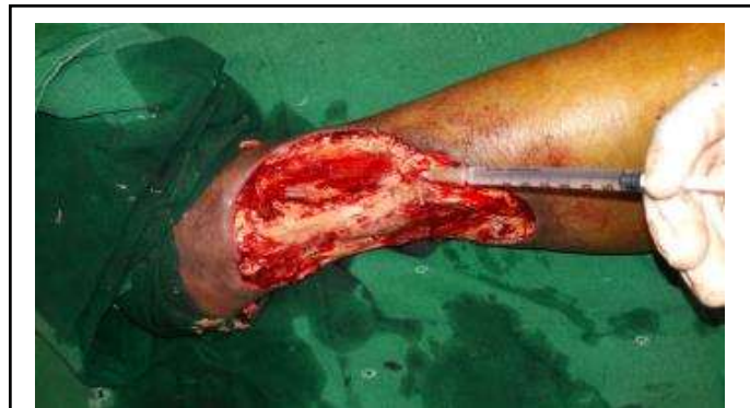
Figure 2: Application of topical insulin to raw area.

and 1b). 0.1 ml of regular insulin was either injected or sprayed onto 1 cm 2 of the wound during the regular dressing of the wound (Figure 2). This was repeated once every 3-5 days when the dressing was changed depending on the soakage. The wound was assessed after 2 weeks.