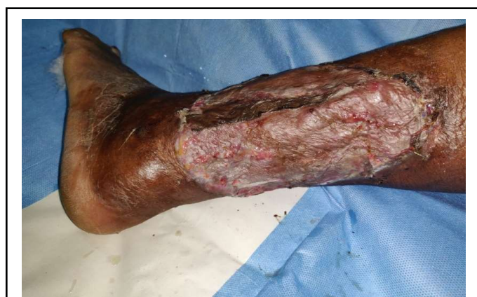
Figure 5: Healing wound bed.