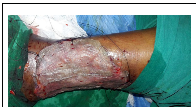
Figure 4: Skin grafting after wound bed preparation.